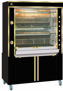
1375.5MLG w/- cupboard base in Luxe black & brass trim