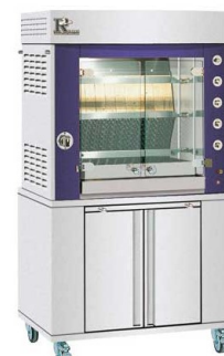
975.2MSG w/- cupboard base in Stainless Steel & blue front panel