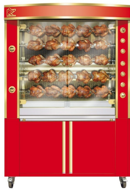
1375.5MLG + COUL1 w/- cupboard base in Luxe red & brass trim