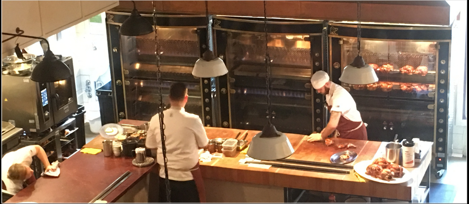
Merivale Group, "The Paddington", Sydney NSW. 3 x Rotisol model 1375.8MLG in Luxe black & brass trim