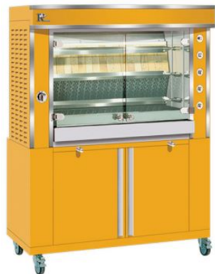
1375.2MLG + COUL1 w/- cupboard base in Luxe yellow & chrome trim

The naked flame from Rotisol's patented gas burners flicker & lick the cast iron hearth creating a spectacular visual, whilst being safe & simple to operate, & very easy to clean. Rotisserie cooking allows the proteins to constantly baste themselves, sealing in natural juices, flavours, and cooking to perfection. The spits are driven by individually controlled electric motors rotating at 2 1/2 times per minute.