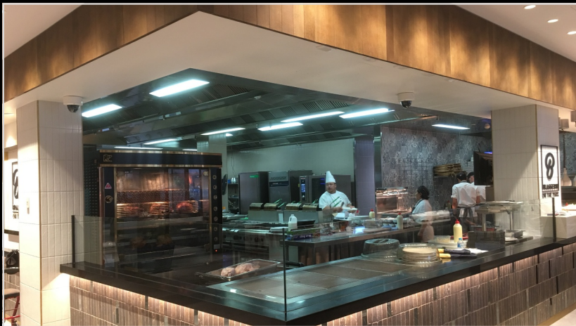
"Cabravale Diggers", Sydney NSW. Rotisol model 1375.8MLG in luxe black & brass trim.