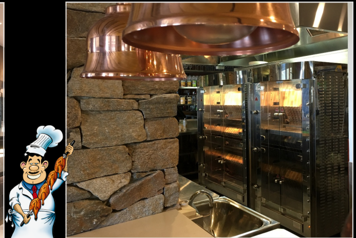
"The Dog Hotel", Randwick, Sydney NSW. Rotisol models 1375.8MiG & 975.8MiG in stainless steel finish.