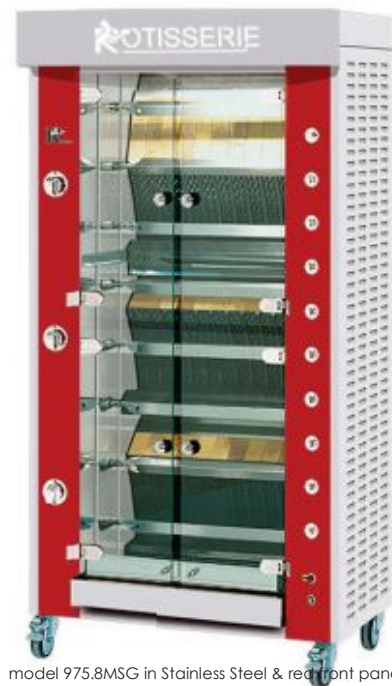
model 975.8MSG in Stainless Steel & red front panel

SIZE COUNTS The Rotisol Millennium rotisserie is available in 2 widths, 1375mm and 975mm. Both widths are available in either 3, 5, or 8 spit capacities. 3 & 5 spit models have a varied assortment of optional cabinet bases available including heated drawer units that will hold the spits directly from the rotisserie, static cupboards, or heated cupboards. The only thing left to decide is the level of finish, or the colour you like. All models are available in either gas or electric. Gas models have full Australian gas certification and approvals.