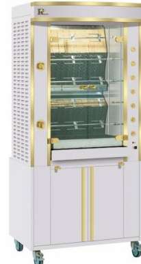
975.5MiLG w/- cupboard base in Stainless Steel & brass trim