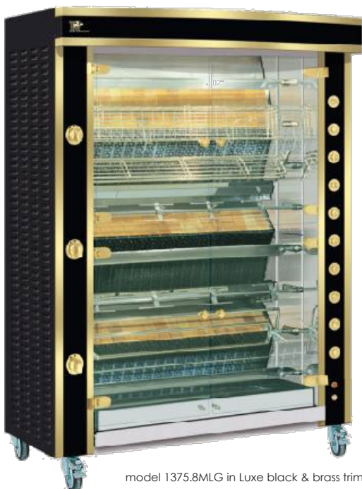
model 1375.8MLG in Luxe black & brass trim

The Grande Flames MILLENNIUM range of ergonomically designed rotisseries, boasts a number of innovative features for increased functionality, and are an ideal show-piece used throughout the world in hotels, resorts, restaurants, pubs, clubs, speciality chicken shops, supermarkets and deli's.