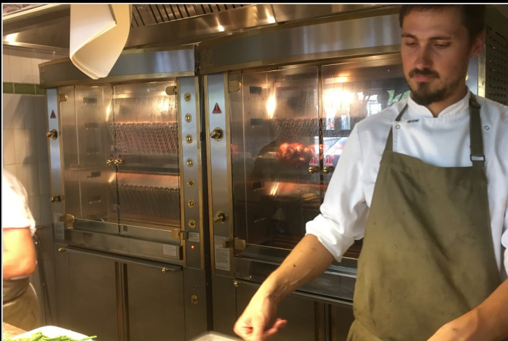
Merivale Group, "The Chicken Shop", Sydney NSW. 2 x Rotisol model 1375.5MiLG in brushed stainless steel with Luxe brass trim